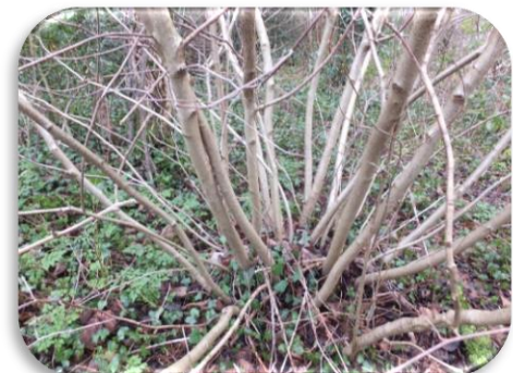
Coppiced oak—four years' growth